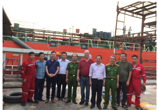
The Team of HCT EEUU and HCT Vietnam with the Authorities of the Fire Police of Vietnam