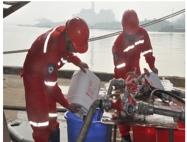
Hoses and Connectors are set up to educt F-500 EA

Since they couldn't find a solution to safely remove the gasoline and vapors in Vietnam, the ship owner estimated cleaning the ship would take 2-3 months and cost more than one million dollars. HCT and HCT Vietnam removed the gasoline and vapors in 5 days, with 16 hours for actual encapsulation. 6,080 liters (1,606 gallons) of F-500 EA were used to encapsulate the estimated 100,000 liters of gasoline. The entire project cost a fraction of the estimates, with only a portion of the cost attributable to Encapsulator Agent.