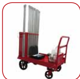
F-500 EA Piercing Rods for Deep-seated Fires