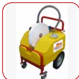
F-500 EA 26 or 40-gallon Portable Carts