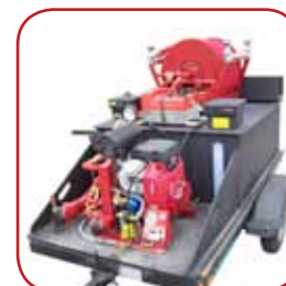
F-500 EA Rapid Response Trailers

F-500 Encapsulator Agent has proven to be indispensable around the coal handling system. A well-equipped power plant will have F-500 EA fire extinguishers, piercing rods, portable carts, Handy Packs and even F-500 EA Rapid Response Trailers at-the-ready for any coal handling event.