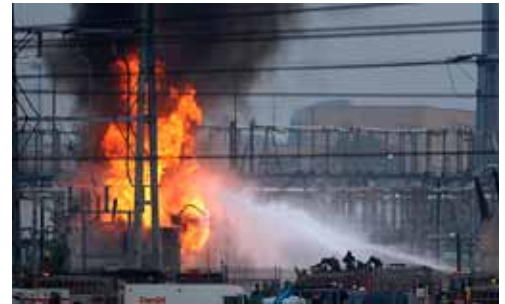
Con Edison monitors FDNY progress at transformer fire.

After this incident, Con Edison began extensive testing of agents on energized transformers. Ultimately, they learned F-500 EA was the only agent capable of being applied to an energized transformer up to 345,000 volts with imperceptible electrical feedback to the nozzle.