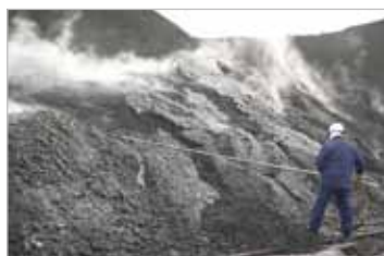
Extinguishing coal stockpile with F-500 EA Piercing Rod

To reduce emissions, the last decade has shown a trend towards sub-bituminous coals. These coals are volatile and rapidly oxidize, frequently resulting in spontaneous combustion. Dealing with these fires has proven to be challenging and dangerous. Foam forms a blanket on the coal, but there is enough oxygen in a pile of coal to sustain the fire. Water stirs up the combustible coal dust, causing dangerous flare-ups. In confined spaces, the flare-ups can lead to explosions.