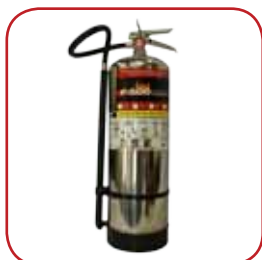
F-500 EA 2.5-gallon Fire Extinguishers

As an encapsulator agent, F-500 EA, mixed with water reduces the surface tension of the water, giving F-500 EA the ability to penetrate up to 15 feet into the coal. Beyond that, in the case of a deep-seated silo or stockpile fire, a piercing rod can be used to deliver the F-500 EA to a targeted area. Secondly, F-500 EA encapsulates the coal dust that is stirred up, preventing flare-ups. Finally, F-500 EA rapidly cools the fuel and surrounding surfaces. If you remove the heat, you remove the fire.