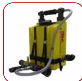
F-500 EA Handy Pack for Rapid Deployment