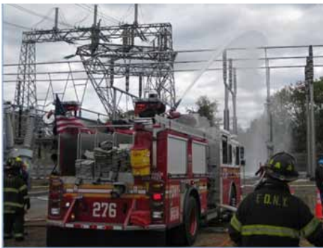
FDNY assist Con Edison, testing F-500 EA applied to a 345,000 volt transformer.

Like turbines, transformers are a three-dimensional fire with extreme heat and Class B oil. F-500 EA is exceptional at extinguishing these fires by encapsulating the oil, cooling the oil and transformer and quickly reducing the black smoke. Con Edison recommends F-500 Encapsulator for transformer fires. After the power is removed, F-500 EA can be safely applied without fear of electrical feedback to the nozzle if the stream comes into contact with nearby energized peripheral equipment.