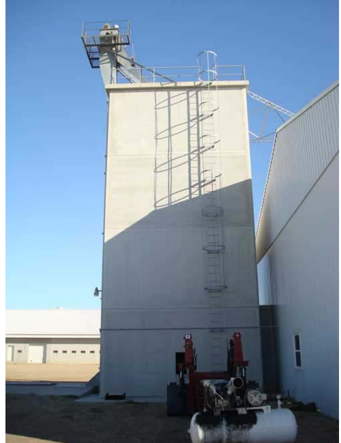
Photo 7. Coal storage silo similar to the one involved in fatal explosion.