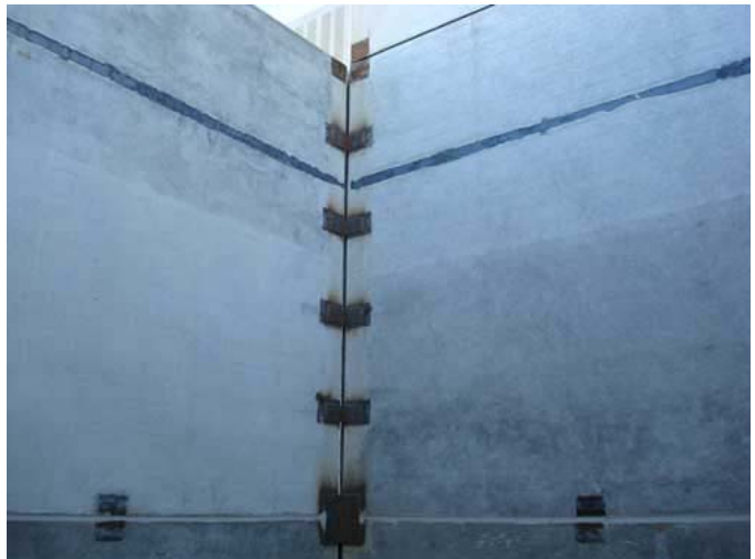
Photo 1. Weld points to hold the panels together in a similar silo. The black metal strip going around the top two sections in the picture is the 4-inch weld strip for the sheet metal funnel transition panels for the corners.

In addition to their toxicity, these gases are highly explosive in certain concentrations, and can further complicate efforts to fight this type of coal fire. Even the most universal firefighting substance, water, cannot always be used because of the possibility of a steam explosion.<sup>1</sup> Water contributes to the exothermic reaction of coal increasing the fire problem.