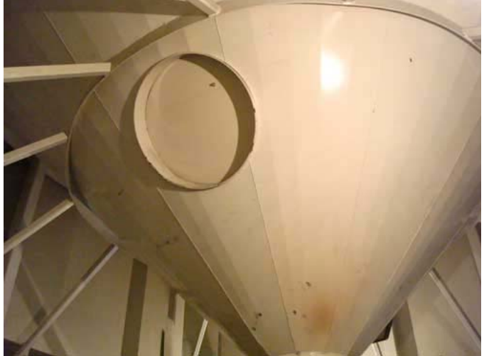
Photo 2. The metal funnel of a similar silo and its associated supports.