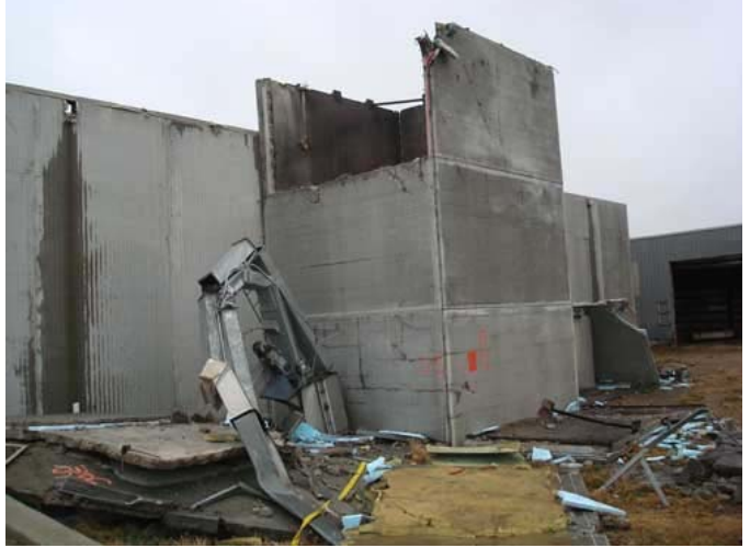
Coal storage silo after explosion

On September 15, 2011 a 20-year-old male, and a 22-year-old male, both volunteer fire fighters, were killed while attempting to extinguish a fire in a coal storage silo. After removing approximately 80 of the 100 tons of coal inside the silo, the two victims attempted to extinguish the fire by applying water through an access hatch on top of the 50 foot silo. An explosion occurred destroying the silo and killing the two victims. A third fire fighter working inside the structure at the base of the silo was seriously injured.