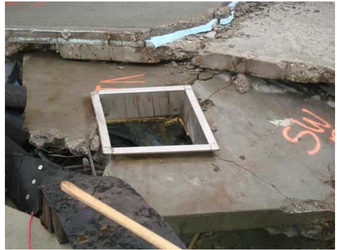
Photo 4. Shows access panel on top of silo where the victims were flowing water at time of explosion.

With the tanker was emptied, the department secured water from an on-site storage tank. They then deployed a 1 inch line to the roof of the storage silo. Fire fighters were still on the roof of the silo at this time and applied approximately 300 gallons of foam through the access port on to the burning coal pile. At this point, the smoke conditions subsided and fire department members and community personnel worked on removing the coal from the storage bin. They removed an access panel on the outside of the funnel where it dumped into the tray housing the augers. They used a grain auger to remove the coal to a portable tank inside the boiler room (<u>Photos 5 & 6</u>). Another grain auger transported the coal outside and into awaiting trucks. The trucks then hauled it away to another location in the community where it could cool down.